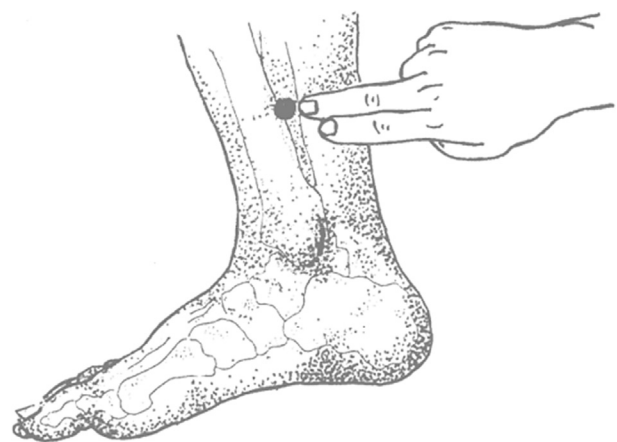
Figure 2 SP-6 acupuncture point.

medical acupuncture. We used only acupuncture, and no other interventions were administered. The intervention group received acupuncture with a 0.25 mm × 40 mm stainless steel C-type needle (Seirin GmbH, Neu-Isenburg, Germany) at LI-4 and SP-6 for 20 minutes. The SP-6 point is located at a width of four fingers above the medial malleolus on the posterior border of the tibia (Fig. 2). The LI-4 point is located on the dorsum of the hand, between the first and second metacarpal bones, in the middle of the second metacarpal bone on the radial side (Fig. 3). Manipulation was performed until the patient reported De-Qi sensation described mostly by tingling, numbness, or warmth and then rotated clockwise every 5 minutes. In the control group, sham acupuncture was performed by superficial contact of needles in the same site points other than correct technical points of acupuncture. A plaster on LI-4 and SP-6 points fixed the needles for 20 minutes, and the needles were shaken every 5 minutes by the acupuncturist. Patients were not aware of the type of acupuncture that they were experiencing.