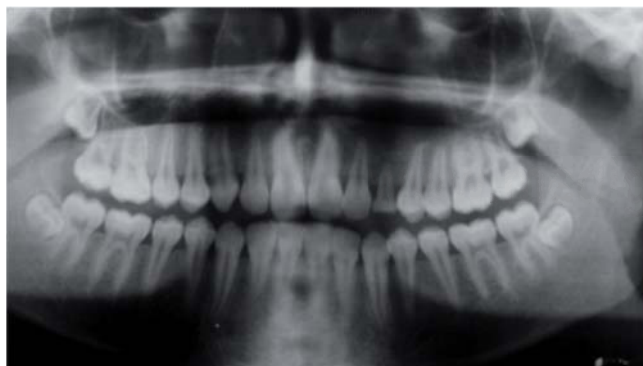
Figure 7. Post-operative orthopantomography, one year, three months. Normal pneumatization of the maxillary sinus, primary canine in position and function. No recurrence report.

has facilitated diagnosis establishment, since it is now related to lesion location. Nevertheless, radiographic interpretation is of the utmost importance, since this study can be considered the basis from where images can be observed, which could otherwise be confused with similar images of dentigerous cysts, calcifying odontogenic cyst, calcifying odontogenic tumor, globulo-maxillary cyst, ameloblastoma, or keratinizing odontogenic tumor. Some reports suggest the fact that in periapical X-rays it is possible to visualize radio-opaque areas within the tumor. This can be an important means to establish a differential diagnosis of this lesion. Nevertheless, all the following factors provide important assistance to establish differential diagnosis: comprehensive clinical assessment of patient as well as frequency, relationship to non-erupted teeth, mainly upper canine, slow asymptomatic growth, with no history of contusion or infection in the affected area, as well as its size, which generally does not exceed 3 mm. 2,7-9,12-14