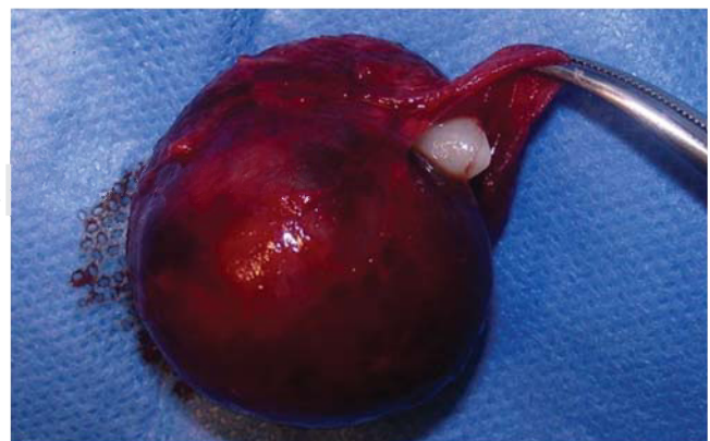
Figure 5. Circumscribed lesion with presence of approximately 4 x 4 cm permanent canine therein.