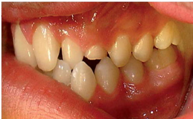
Figure 2. Absence of permanent canine, volume increase, lack of infection reports.

Histopathological report was as follows: odontogenic lineage lesion composed of a thick wall of lax, well vascularized fibrous tissue, with recent and previous hemorrhage zone, fully lined with cuboidal-like epithelium, forming duct-like structures filled with amorphous basophilic material and surrounded by a layer of cuboidal and fusiform cells. Within these cells