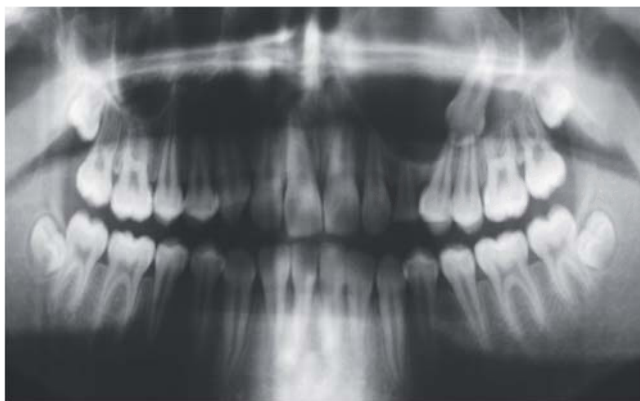
Figure 3. Pre-surgical orthopantomography. Tooth tilted in mesial direction with respect to the lesion. Lesion filling maxillary sinus Lack of root resorption data.