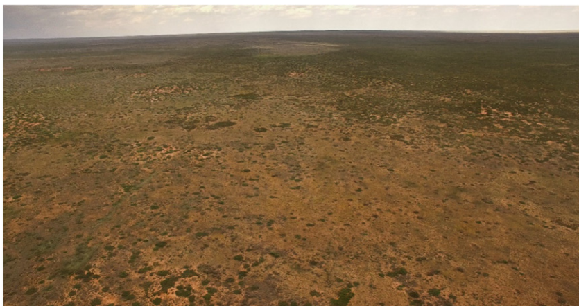
Figure 3. Woodland expansion in sagebrush steppe (A; photo by Todd Forbes), red cedar expansion (B, photo by Sandra Murphy), and honey mesquite expansion (C, photo by Jeremy Roberts) in prairies of western North America.