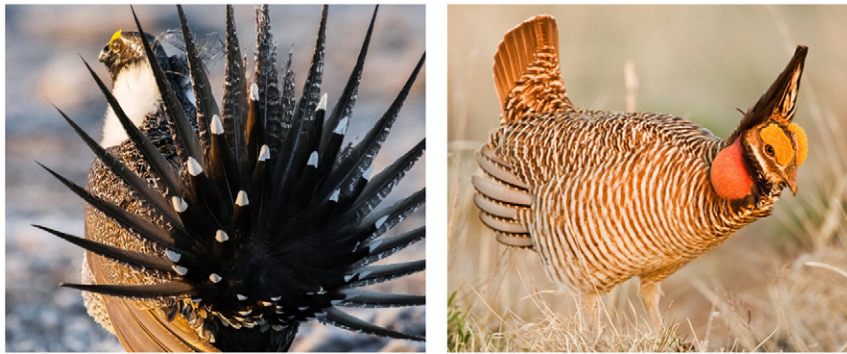
Figure 1. Greater Sage-Grouse (left) and Lesser Prairie-Chicken (right) serve as flagship species for ecosystem conservation.

application of such a strategy at ecologically meaningful scales, along with rigorous evaluations of their management efficacy. Wide-scale restoration efforts to reduce the threat of woodland expansion across prairie and sagebrush systems provide one such case study.