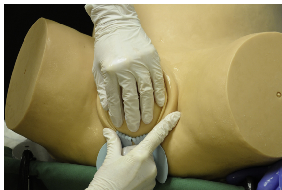
Fig. 2. As the crowning progresses, the vaginal opening becomes circular. This change results in the movement of the wings together. The posterior commissure is effectively locked between the tongue and the wings, and the device prevents the initiation of tearing when the head is maximally crowned. The device should be kept in place by the assistant during delivery of the shoulders. If an episiotomy is required, it can be performed laterally of the device. In the case of an instrumental delivery, the device can be used as described earlier. The assistant then holds the device in place to reduce the risk of tears, while the obstetrician performs the instrumental delivery by steering the head gently through the introitus. The device is preferably kept in place during the delivery of the shoulders.