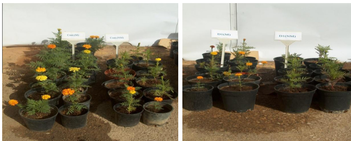
Figure 2 Effects of mycorrhizal fungus ( Glomus constrictum ) on the flowering growth of marigold plants grown either under well-watered (left) or under drought stress condition (right), where M = treated, NM = non-treated mycorrhizal plants.

et al., 1991). Dell-Amico et al. (2002) also found that the inoculation of tomato plants with G. clarum encouraged higher growth rates of plants in both well-watered and stressed conditions. Drought-stressed non-mycorrhizal plants produced lower products than mycorrhizal ones at all drought treatments (Table 1). These results are in good agreement with Al-Karaki et al. (2004), who observed that the inoculation with AM fungi provided an important enhancement to yield of two wheat cultivars. Sorial (2001) also observed increases in straw and grain yield of wheat plants subjected to different levels of water stress and inoculated with arbuscular mycorrhiza when compared to non-mycorrhizal plants. The enhancement in marigold growth and biomass yields due to AM fungi might be attributed to higher mineral and water uptake. Al-Karaki and Clark (1998) stated that the enhanced plant growth as well as yield following AM inoculation were due to the improved uptake of P and Cu, especially under water-stressed conditions. Whereas, M+ plants were taller than M- plants regardless of levels of drought stress, and the mycorrhizal response was more pronounced in severe drought treatment (D 4 ).