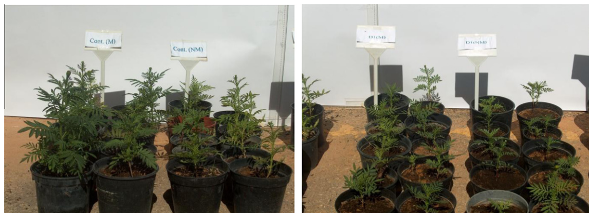
Figure 1 Effects of mycorrhizal fungus ( Glomus constrictum ) on the vegetative growth of marigold plants grown either under well-watered (left) or under drought stress condition (right), where M = treated and NM = non-treated mycorrhizal plants.

* Significant difference at p \leq 0.05 (Steel and Torrie, 1980).