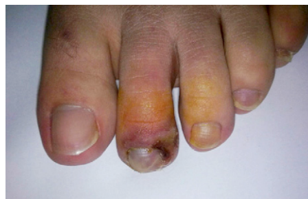
Fig. 1 – Necrotic appearance of the tip of the second toe of patient's right foot with purple to bluish discoloration.