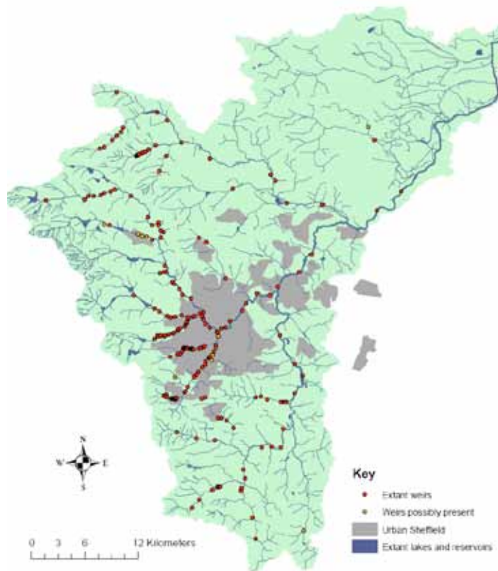
Fig. 1. Distribution of weirs in the Don Catchment

Many stakeholder groups would like to modify the weirs. These include anglers wanting to install fish passes; potential victims of flooding interested in removing weirs; proponents of hydro-electricity wishing to install micro-hydro schemes; enthusiasts of natural history aspiring to restore the river to a more natural state and enthusiasts of the river's heritage want to conserve weirs for their historic value. The various aspirations represent the multiple ecosystem services the rivers in the catchment can provide.