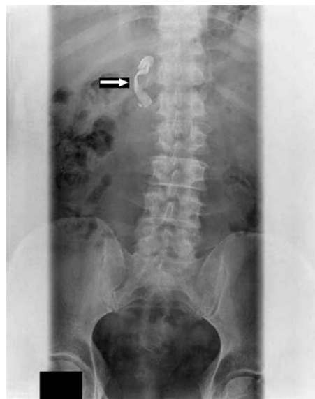
Figure 1. Case 1: plain X-ray of the abdomen. Note the well-defined radio-opaque marker of the retained swab (arrow).

the right upper abdomen (Figure 1). CT for radiotherapy programming revealed a 28 × 35 × 25 mm isodense mass with high-density structure in the left anterior subphrenic space. The diagnosis was based on previous surgical history and typical sponge-like material seen in radiology. The patient went on programmed radiotherapy and the mass was left untreated due to there being no related clinical symptoms of the incidental gossypiboma. No related event was noted at the patient's 1-year follow-up.