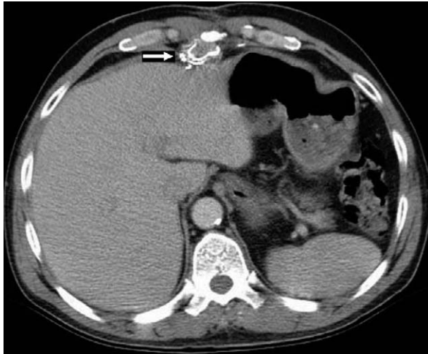
Figure 2. Case 2: axial abdominal computed tomography scan. Note the mass with typical high-density whirling structures (arrow) in the left anterior subphrenic space.

A 23-year-old woman had chest contusion complicated with hemothorax. About 2 years and 2 months after surgical chest drainage via a transthoracic approach, she had sore throat, cough and mild hemoptysis for several days. CT for persistent shadow over the left upper lung field on chest plain film revealed a 40 \times 28 \times 30 mm isodense mass with typical high-density whirling structure in the anterior segment of the left upper lobe of the lung. She was the only patient who had a correct sponge count among our cases. Resection was performed and pathology confirmed the gossypiboma at another institution. No related clinical event was noted at the patient's recent follow-up.