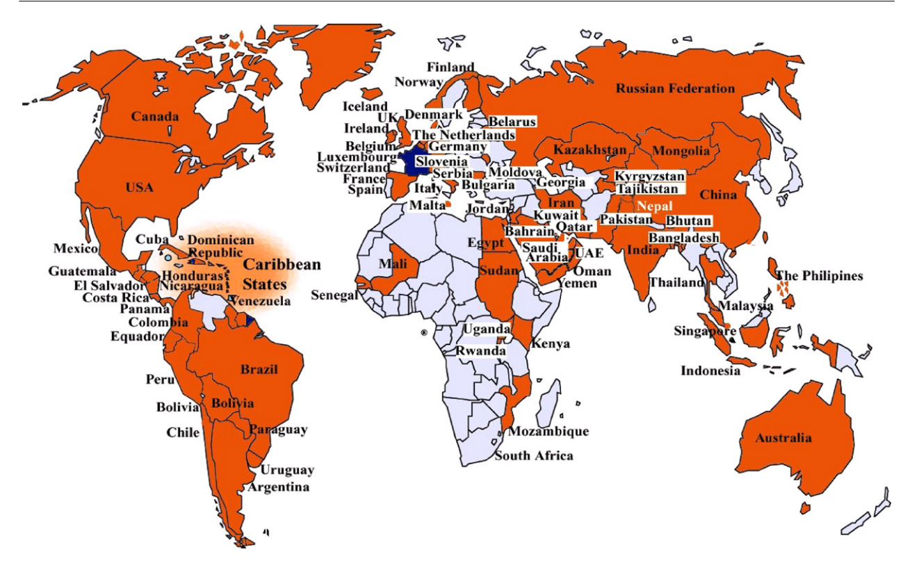
Figure 2 Status of Country Pledges, July 2008.