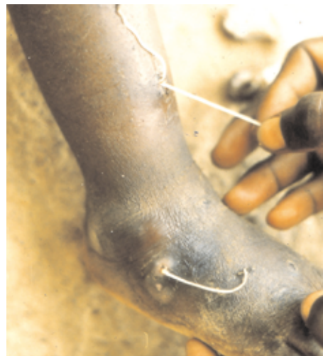
Figure 2. Several Guinea worms emerging from a leg of a patient from Ghana, photo by Dr. A. Tayeh.

liquid into the water that contains millions of immature larvae. When released in water, the larvae are ingested by copepods where they moult twice and become infective larvae within two weeks[11]. This contaminates the drinking water source and the cycle begins anew[12].