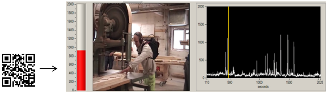
Fig. 1. Example of a QR code linking to a PIMEX video.