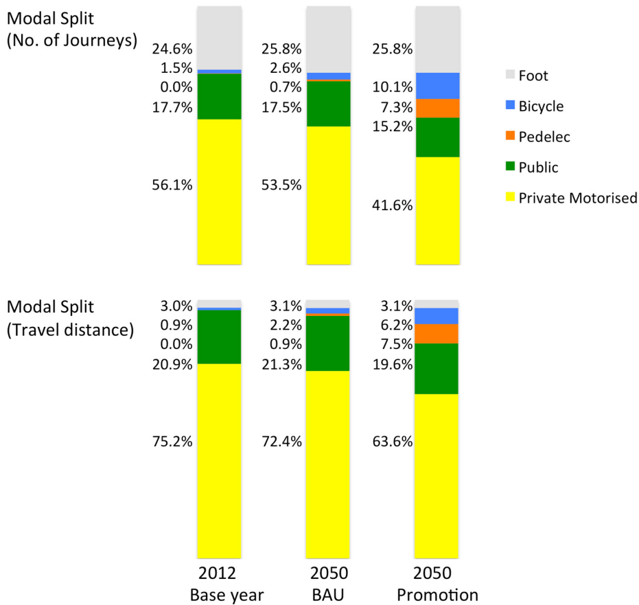
Fig. 2. Modal split in 2050 under the two scenarios (Rudolph 2014).

In the ambitious Pedelec Promotion scenario, the combined number of journeys travelled by bicycle and pedelec represents a 3.2 percent share of the modal split in 2020, which is already higher than the combined total for bicycles and pedelecs under the BAU scenario in 2050. This largely reflects the similar level of infrastructure development at the two points in time under the two different scenarios.