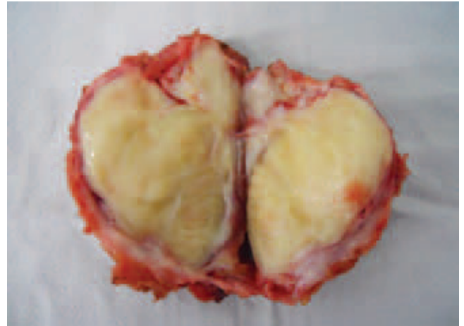
Fig. 3 – Desmoid tumor of the abdominal wall.

Proctocolectomy with J-pouch ileoanal anastomosis is the gold standard treatment for FAP and was performed in 18 (24%) of the patients. This procedure is typically recommended when there are many polyps in the rectum or in patients with severe genotype (i.e. mutations between codons 1250 and 1464). 20,24,25 Young women considering pregnancy should avoid or postpone RCP as fertility may be reduced as reported in some studies, 26 although a more recent one found no association with the type of operation. 27 Early and late complications rates in our patients were 38.9% and 27.8%. Anastomotic dehiscence was the most common cause of morbidity (71.4%). Mortality rate was 5.5%.