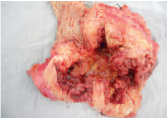
Fig. 2 – Invasive colorectal carcinoma in a patient with FAP.

Most patients in our study (54 [72%]) underwent IRA. IRA is technically simpler than RCP with lower morbidity and mortality rates. It also avoids the need for a permanent ileal stoma seen in PCI, with better quality of life. 20,21 The main advantage of rectal preservation is better functional outcomes. Disadvantages are the need of periodic rectal surveillance for new polyps and the association to metachronous rectal cancer in some cases. It is usually recommended when there are very few polyps in the rectum (less than 20) and in patients with mild genotype. 22,23 In the present study early and late complication rates were similar (22.2% × 20.4%). The main cause of early morbidity was anastomotic dehiscence (41.7%) and the most common late complication was intestinal obstruction (63.7%). Mortality rate related to the procedure was 1.85%.