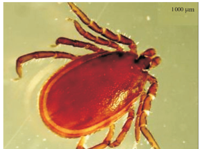
Figure 2. Extracted tick ( I. ricinus ) from cattle.

During the study, among 11 villages, a total number of 1563 ticks were isolated from 150 examined cattle from 25 herds. The mean intensity for each animal was 10.42. Two tick genera and species were observed and recognized during the study including: Ixodes ricinus ( I. ricinus ) 802 (51%) (111 male, 691 female) and Boophilus annulatus ( B. annulatus ) 761 (49%) (51 male and 710 female) (Figures 2 and 3). Totally 1401 female and 162 male ticks were extracted from examined cattle. Moreover, no soft tick (Argasidae family) was observed.