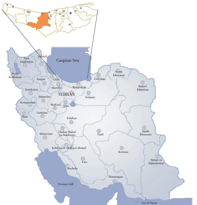
Figure 1. Map of Iran, highlighting the position of Nur County in Mazandaran province.

Nur County ( 36^{\circ}34'25''\text{N} , 52^{\circ}40' 52^{\circ}00'50''\text{E} ) ( 2675.00 \text{ km}^2 ) is located on the Caspian Sea coast and belongs to Mazandaran province. This area embraces abundant superficial water resources which is proper for agriculture and animal husbandry. This district contains pastures and forests which are favorable for cattle grazing (Figure 1).