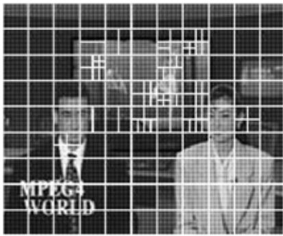
Fig.2 Example of inter coding modes in H.264

Fig.2 shows a typical frame of QCIF sequence “News” [9] . The block sizes depicted in Fig.2 are chosen by original full and brute search scheme in H.264. It’s easy to see that flat and homogenous areas such as the background, the black suit of the man and the white suit of the woman are encoded using 16 \times 16 block sizes. On