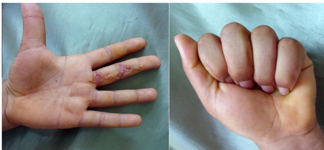
Fig. 4 – Good functional result with no recurrence.

granulomatous tenosynovitis, such as a fungal infection, brucellosis, tenosynovitis of foreign bodies, or sarcoidosis [3,4]. Once diagnosed, treatment is very simple and the patient usually heals with little or no sequelae. Antitubercular treatment is based on an initial quadruple therapy (associating isoniazid, rifampicin, pyrazinamide, and ethambutol) for 2 months. After 2 months and in the absence of resistance, the treatment is continued using a combination of isoniazid and rifampicin. The minimum duration of TB treatment in the bone and joint remains poorly defined.