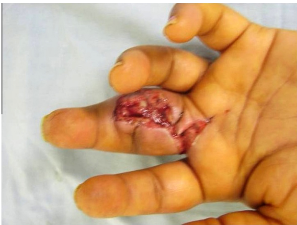
Fig. 2 – Intraoperative view showing the tenosynovitis.