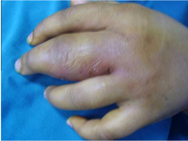
Fig. 1 – Clinical appearance showing the swelling the inflammatory signs of the middle finger.