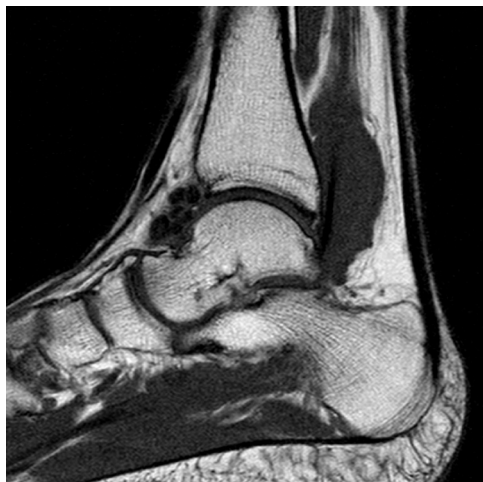
Fig. 2. The loose bodies are demonstrated on the anterior aspect of the ankle joint in the sagittal T1-weighted MRI.

of bone or joint diseases. The physical examination revealed that he had mild tenderness around the anterior ankle joint on palpation with palpable loose bodies. The plantar flexion and dorsiflexion angles were 25^\circ and 5^\circ , respectively. He had increased pain during dorsiflexion. No sign of instability appeared in the ankle joint. Multiple nodules 3–9 mm in diameter with calcifications were located at the anterior aspect of the right ankle on the plain anteroposterior and lateral X-ray images (Fig. 1). Magnetic resonance imaging (MRI) revealed multiple calcified well-circumscribed loose bodies at the same location and synovitis in the ankle joint (Fig. 2). The laboratory tests were within the normal limits and the patient was