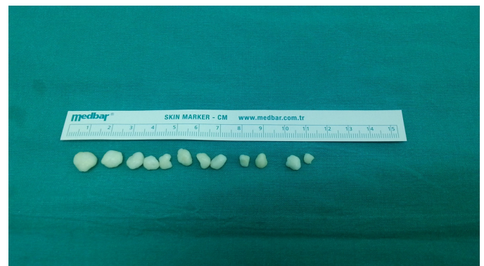
Fig. 4. The macroscopic appearance of the loose bodies after arthroscopic excision.

The patient's dorsiflexion and plantar flexion degrees were 25^\circ and 30^\circ , respectively, at the end of the 11th postoperative month. No complications were diagnosed in the follow-up period with no recurrence on the plain X-ray images and MRI.