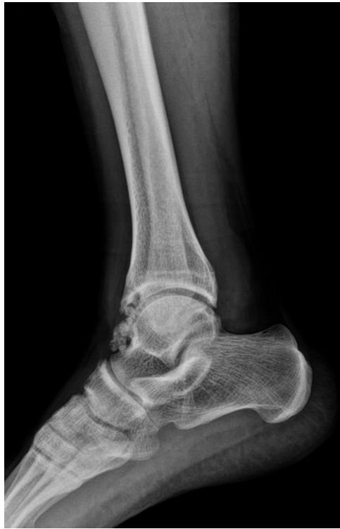
Fig. 1. The lateral plain radiographic image of the ankle joint. Multiple calcified foci are seen on the anterior aspect of the ankle joint.

of bone or joint diseases. The physical examination revealed that he had mild tenderness around the anterior ankle joint on palpation with palpable loose bodies. The plantar flexion and dorsiflexion angles were 25^\circ and 5^\circ , respectively. He had increased pain during dorsiflexion. No sign of instability appeared in the ankle joint. Multiple nodules 3–9 mm in diameter with calcifications were located at the anterior aspect of the right ankle on the plain anteroposterior and lateral X-ray images (Fig. 1). Magnetic resonance imaging (MRI) revealed multiple calcified well-circumscribed loose bodies at the same location and synovitis in the ankle joint (Fig. 2). The laboratory tests were within the normal limits and the patient was