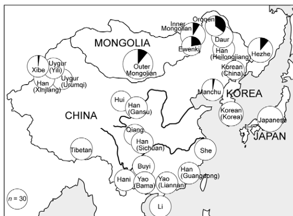
Figure 3 Geographical distribution of Manchu cluster chromosomes. Circles , Populations sampled, with area proportional to sample size. Filled sectors , Manchu clusters.

maintained many concubines. A central part of the Qing social system was the army, the Eight Banners, which was made up of separate Manchu, Mongolian, and Chinese (Han) Eight Banners. The nobility occupied high ranks in the Manchu Eight Banners but not in the Mongolian or Chinese Eight Banners; the Manchu Eight Banners were recruited from the Manchu, Mongolian, Daur, Oroqen, Ewenki, Xibe, and a few other populations. A social mechanism was thus established that would have led to the increase of the specific Y lineage carried by Giocangga and Nurhaci and to its spread into a limited number of populations. We suggest that this lineage was the Manchu lineage.