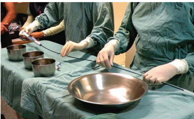
Figure 2 18-French prosthesis delivery system.

The puncture or dissection area was infiltrated with local anesthetic (bupivacaine 0.5% or ropivacaine 0.75%), as well as at the end of the procedure, to minimize postoperative pain. We kept the temporary pacemaker until discharge from the postoperative unit (POU).