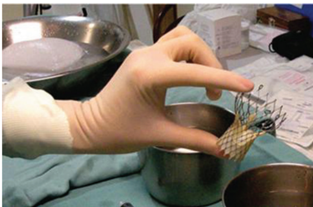
Figure 1 Bioprosthesis of three porcine pericardium leaflets mounted and sutured in a self-expanding nitinol stent.

series of vascular molds to reduce its profile and is fixed at an 18-French delivery system, releasing the prosthesis after balloon valvuloplasty (Figure 2).