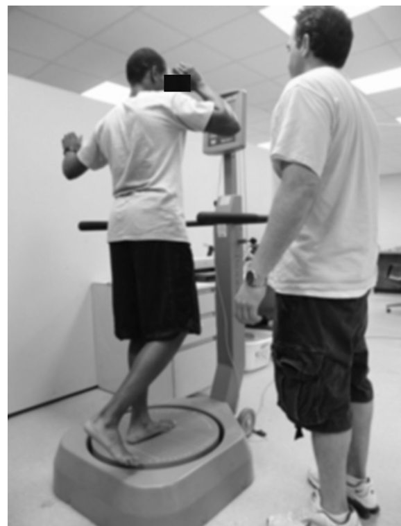
Fig. 3. Single limb balance test.

The single limb athletic test (Fig. 3) performed on the Biodex Balance System SD (Biodex Medical Systems, Inc.) was used to assess single limb stability. The single limb athletic test is a dynamic stability test performed on an unstable platform without upper extremity support. Levels of difficulty range from 1 (hardest) to 12 (easiest), and level 10 was used in our assessment. Level 10 was used after a pilot study revealed it was a safe level to perform when the participant was blindfolded and the participants were required to use the hip strategy to maintain balance. Four different conditions were performed: right (dominate) limb with eyes open; left (non-dominant) limb with eyes open; right limb blindfolded; and left limb blindfolded. Each test was performed for three 10-s trials.