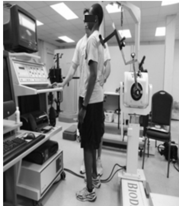
Fig. 2. Trunk extension strength test.

endurance tests was to hold a static position for as long as possible. The endurance tests were the trunk flexor test, trunk extensor test, and bilateral side bridge tests.