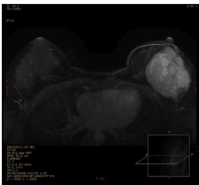
Fig. 2. MRI.