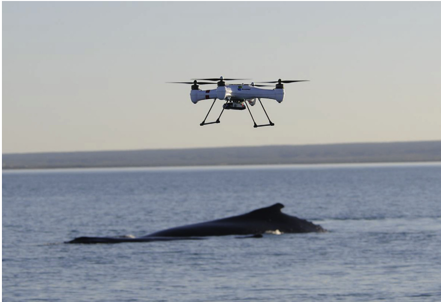
Figure 1. Quadcopter unmanned aerial systems (UAS) hovering in the foreground with a humpback whale in the background. Although it appears large, the copter is 500 mm in diameter and 230 mm in height, with landing gear. These platforms, multirotors and fixed-wings are being used to collect data of several types (e.g. photogrammetry, exhalent samples, thermal imagery). Given the rapid acceleration in the UAS technology, we expect the use of these systems to increase for behavioural as well as other research applications.

cetaceans is a significant step forward for answering questions of basic ecology as well as helping to address conservation concerns.