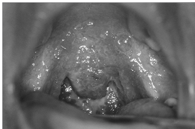
Figure 1. Granulomatous infiltrate in the oropharynx.

Physical exam: 16-week pregnant patient had soft palpable and painless nodes in her left sternocleidomastoid region, without signs of infection or fistula. In the oropharyngoscopy we noticed a granulomatous, hyperemic, friable lesion, involving the soft palate, uvula, tonsils and the posterior pharyngeal wall, especially on the right side, without secretions or ulcerations (Figure 1). The rest of her oral cavity did not show alterations.