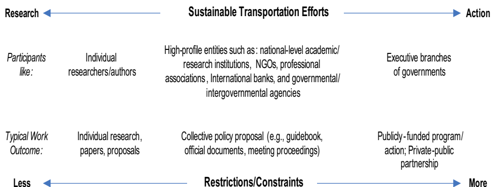
Fig. 2 Taxonomy used to classify efforts towards sustainable transportation.

The foregoing section identifies and reviews existing efforts towards sustainable transportation. To better evaluate different efforts as a whole, there must be a way to synthesize them. Fig. 2 is the “taxonomy” used in this paper to complete the synthesis while Table 2 groups different efforts (especially proposed approaches to, and strategies for sustainable transportation) into a two-dimension table per the prescribed taxonomy. The taxonomy uses influence (ownership), status of participant, scope/content, and relation to research/action to classify different efforts.