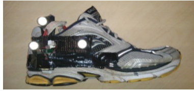
Fig. 1. ION and Jig attached to shoe.