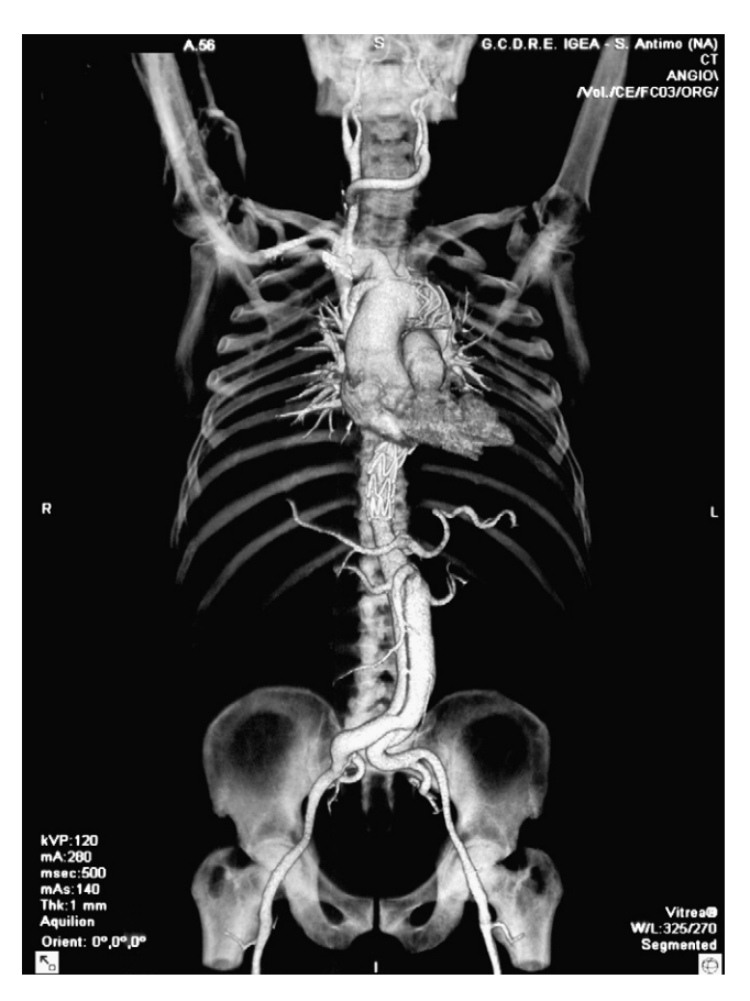
Figure 2. Six months follow-up computed tomographic scan confirmed patency of the prosthetic bypass graft and the complete thromboexclusion of the false lumen.

Contemporary studies assess the risk of paraplegia after conventional surgical repair of the descending thoracic aorta to be between 7% and 36%<sup>4</sup>: some authors recommend adjunctive techniques, such as spinal fluid drainage, to prevent paraplegia, whereas others consider such techniques to be superfluous.<sup>5</sup> Otherwise, as reported