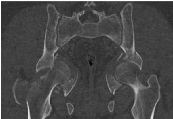
Fig. 1. Pre-operative coronal pelvic CT.

Following this he required inpatient rehabilitation for four months. On discharge home he was mobilising independently with two elbow crutches indoors and outdoors up to 40 m.