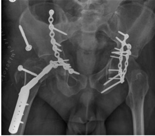
Fig. 2. Postoperative AP XR of the pelvis.