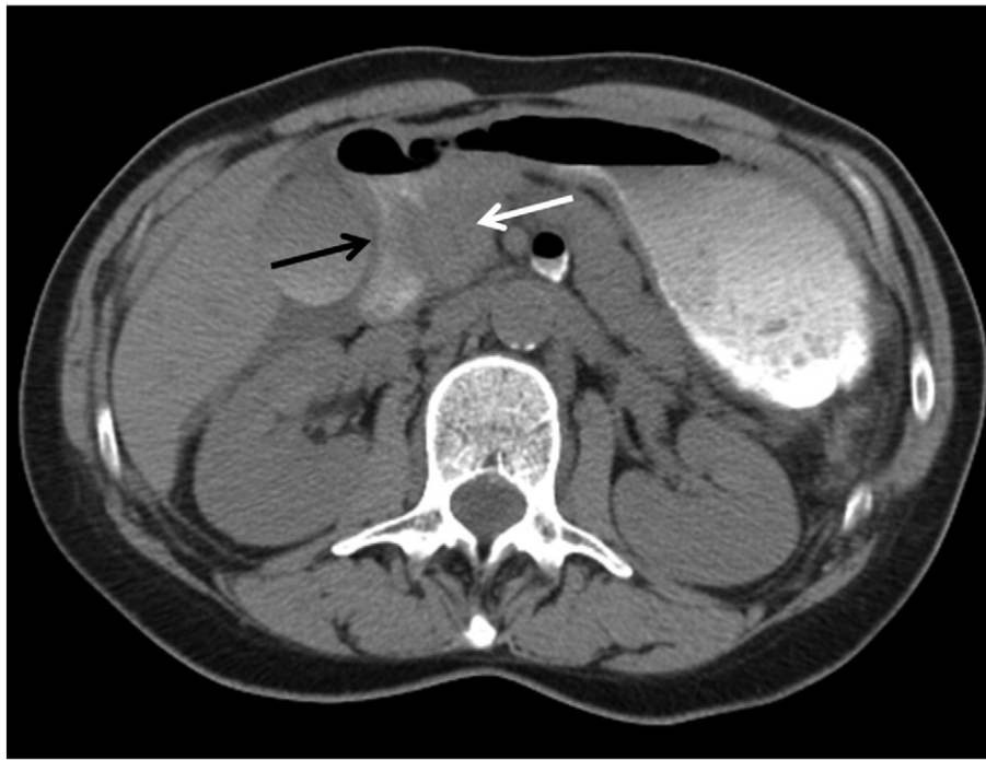
Fig. 1. High grade small bowel obstruction at the level of the duodenum (black arrow) secondary to peripancreatic lymphadenopathy (white arrow).

superior mesenteric vessels. The final diagnosis was stage IIIC, high-grade papillary serous ovarian cancer.