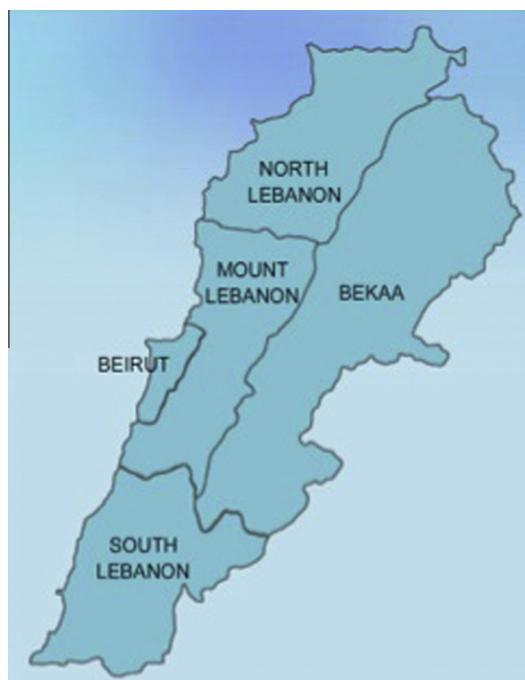
Fig. 2B Map of Lebanon showing various geographic regions.