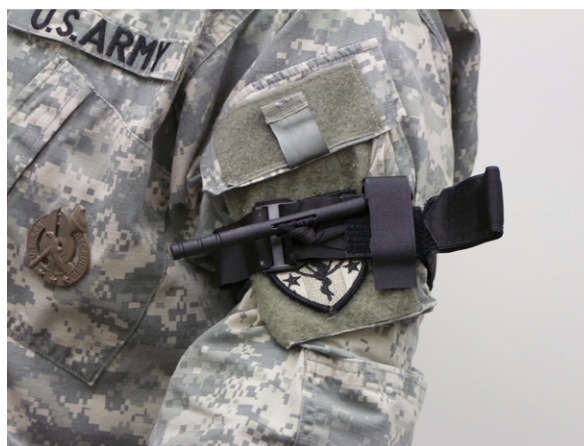
Fig 3. This is a recent photograph of a C-A-T, the Combat Action Tourniquet, applied to the arm of an active-duty Army soldier.

lives and limbs. Use of tourniquets will be remembered as one of the seminal lessons of those wars, in regards to trauma care.