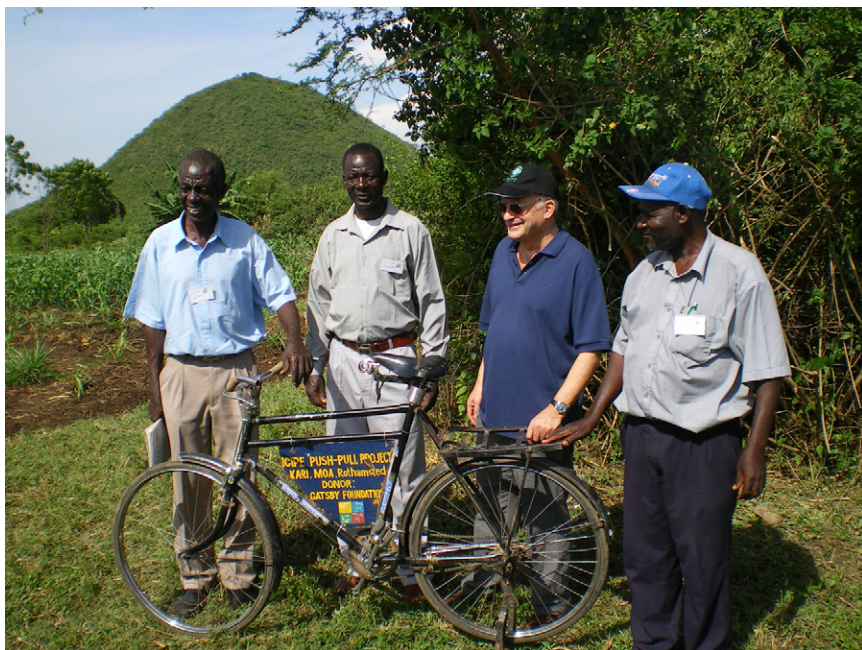
Push-pull: Kenyan farmers trained to teach other farmers the push-pull approach pose with Lord David Sainsbury, who visited the project in 2010. Lord Sainsbury's Gatsby Charitable Foundation funded development and implementation of the push-pull project for 15 years (1994–2009).

to collecting wild yams and to hunting animals in communal forests, which may lead to conflict with conservation concerns and further degrade the remaining forests.