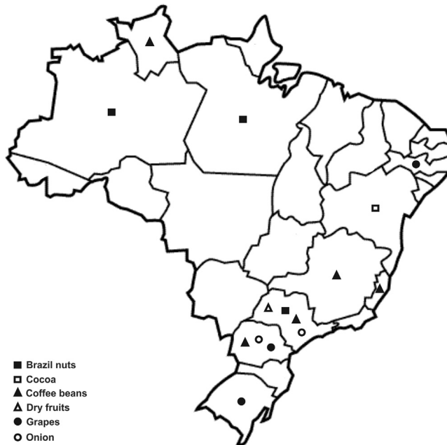
Fig. 2. Brazilian map depicting the locations from which samples were obtained.