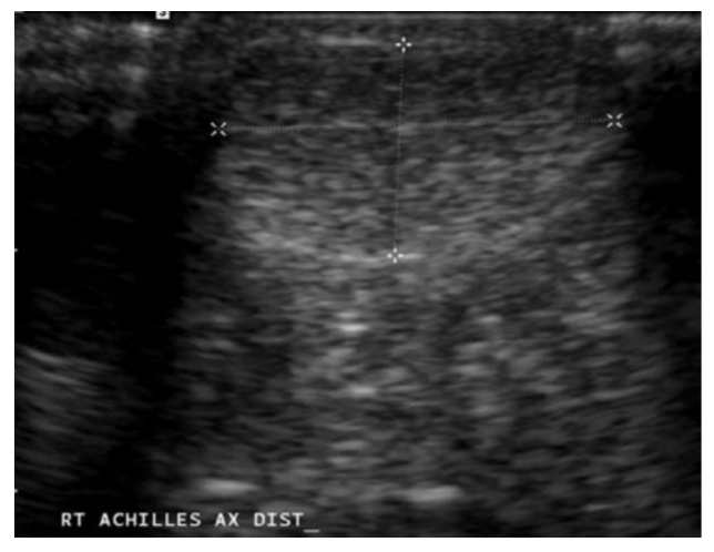
Figure 3. Transverse sonographic image of the right distal Achilles tendon, showing diffuse thickening (cursors).

The fluoroquinolones are frequently prescribed for a variety of infections -- most commonly of the urinary and respiratory tract. A recent study of fluoroquinolone usage in U.S. hospitals found a mean rate of 150 daily doses /