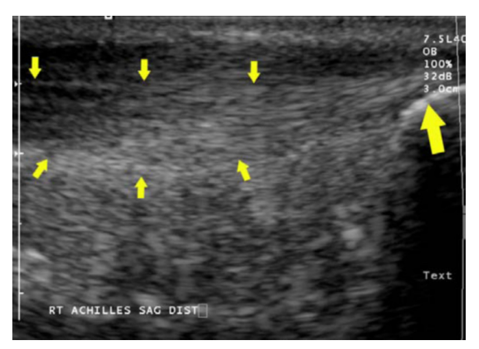
Figure 4. Sagittal sonographic view of right distal Achilles tendon, showing focal thickening (small arrows) slightly proximal to the calcaneal insertion (large arrow).

The Achilles tendon is most commonly affected, with involvement of quadriceps, peroneus brevis, extensor pollicis longus, long head of biceps, rotator cuff tendons and other tendons also reported (6, 11). Some authors have suggested an increased prevalence in males (6, 12). Fluoroquinolone tendinopathy often has an abrupt and spontaneous onset, is frequently bilateral, and is accompanied by