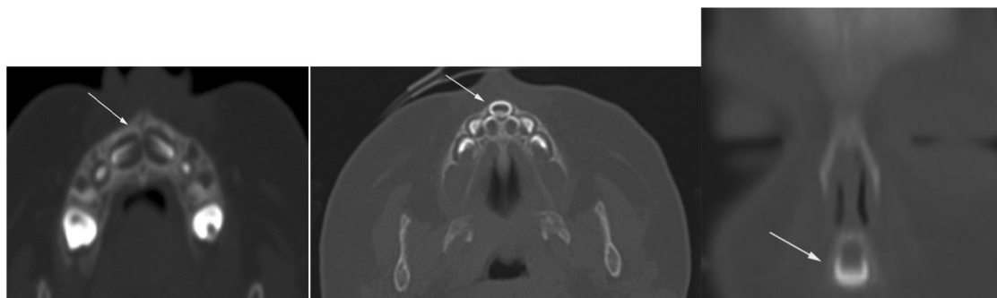
Fig. 1 – CT images through the hard palate in two 9-month-old females. An axial view of maxillary segment with normal tooth crowns is shown on the far left (arrow). In contrast with an axial view showing a solitary median maxillary central incisor (middle image, arrow). On the far right is a coronal view of a solitary median maxillary central incisor (arrow).

These phenotypic characteristics of SMMCI are thought to arise due to an interruption in development during gestational days 35-38 [4,8,9]. Interaction between the nasal placode and the nasal processes that form the central maxilla are disrupted leading to cranial facial, dentition, and nasal airway malformations. CNPAS may be an isolated anomaly. However,