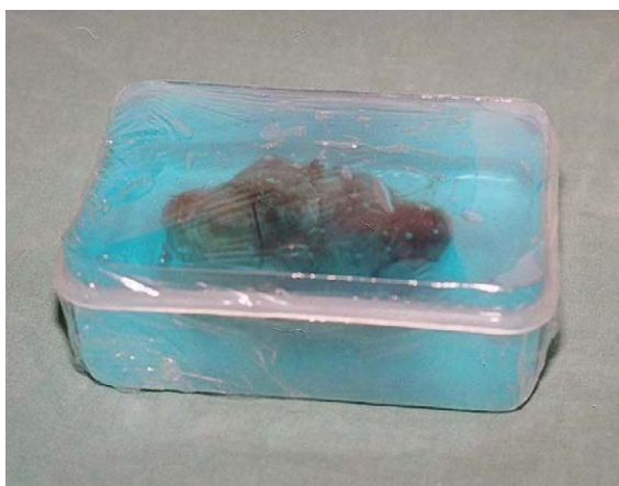
Fig. 2. The surgical specimens of hyperplastic thyroid glands were embedded in containers filled with gel, which were tightly covered with a thin layer of stretch film.

During the longitudinal scan using the dual image US technique, the scan was started at one end of the tissue specimen, and care was taken to include as much of the specimen in the first image as possible. The second image was obtained as the transducer was moved toward the other end of the specimen until the second image was aligned with the first image. The correct alignment of the images was determined by approximating the cut-off margin of the tissue specimen in the second image with that in the first image and by the correct alignment of the echogenic tissues of the surgical specimen in the two images monitored during the sweeping motion of the transducer, as described previously [4]. The standard distance of 3 mm for the gap between the two images on the monitor was subtracted from the calculated value of the longitudinal dimension of the specimen by dual image US