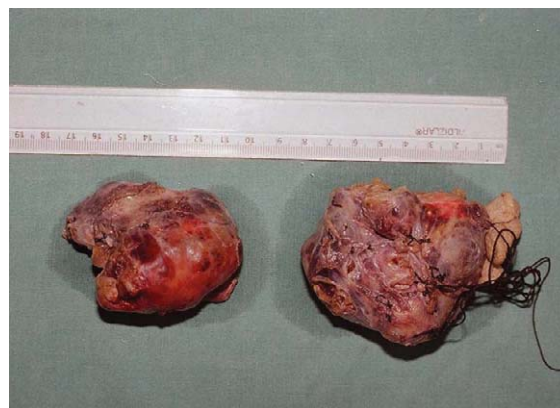
Fig. 1. The actual longitudinal dimension measurements of surgical specimens were performed manually in the postoperative period after being fixed in 10% formalin solution for 1 day.

Thirteen female patients with thyroid hyperplasia and a mean age of 40.9 \pm 10 years (range, 24–65 years) undergoing bilateral subtotal or total thyroidectomy were included in this study. Out of 26 thyroid lobes removed during surgery, four single lobes from four patients could not be excised in one piece and were excluded because of resultant loss of anatomic integrity. Thus, measurement of the longitudinal dimension using US was carried out in the remaining 22 excised lobes. The actual longitudinal dimensions of these surgical specimens were measured manually in the postoperative period after being fixed in 10% formalin solution for 1 day (Fig. 1). The actual measurements of the longitudinal dimensions were calculated in millimeters and were performed by one of the authors. The surgical specimens were then embedded in containers filled with gel and were tightly covered with a thin layer of stretch film (Fig. 2). The study protocol was approved by the local institutional training board (ethical committee) of our hospital, and all patients included in the study gave their informed consent.