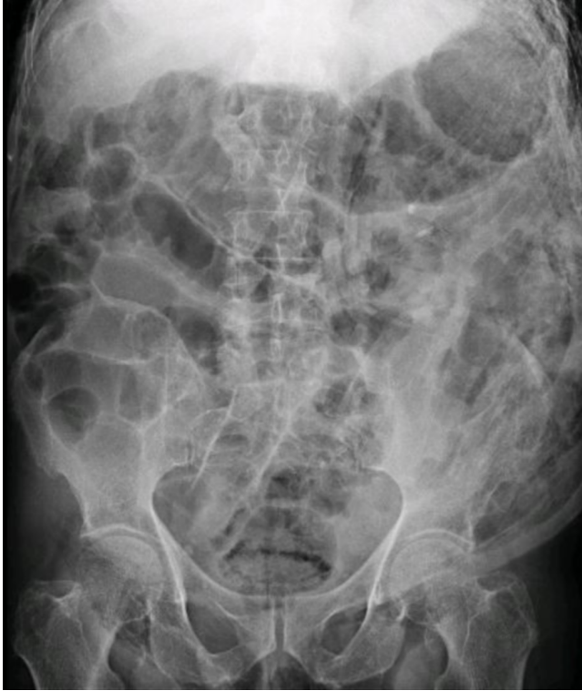
Figure 2. 80-year-old man with massive subcutaneous emphysema. Abdominal radiograph shows extensive subcutaneous emphysema of the abdominal wall.

puted tomography (CT) without oral or intravenous contrast confirmed the radiographic findings and demonstrated pneumorrhachis (Fig. 3), as well as pneumomediastinum, pneumothorax, and pneumoscrotum. CT also revealed a fistula between the colic anastomosis and the left abdominal wall leading to the formation of an abscess in the abdominal wall. A few bubbles of extraluminal air were seen in the proximity of the anastomotic leak. Once his condition was stable, the patient was transferred to the operating room. Surgical exploration revealed a fecaloïd abscess of the abdominal wall, and it confirmed the anastomotic leakage and the colocutaneous fistula.