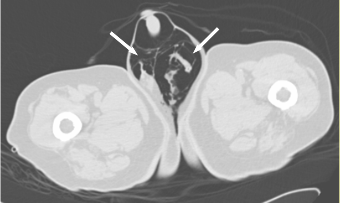
Figure 3B. 80-year-old man with massive subcutaneous emphysema. CT of perineum shows bilateral intrascrotal air (arrows).

explains spread of gas into the other extraperitoneal areas in our patient. It is well established that an anatomical route along the fascial planes exists between the neck, the chest, and the abdomen [9, 10]. And because fascial planes in the neck communicate through the retropharyngeal space with the mediastinum, air can track into the thorax and even into the epidural space [11]. This explained the pneumomediastinum, pneumothorax, and pneumorrhachis in this patient.