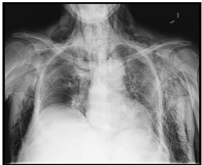
Figure 1. 80-year-old man with massive subcutaneous emphysema. Chest radiograph shows subcutaneous emphysema over anterior chest wall and neck.

Chest radiograph and abdominal radiograph showed extensive subcutaneous emphysema over the neck, anterior chest wall (Fig. 1), and abdominal wall (Fig. 2). Body com-