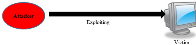
Fig. 3. Attacker exploiting victim's system

Now if the attacker would do vulnerability assessment of the victim's system/network, he would not find any open vulnerability in the victim's system/network. In absence of open vulnerabilities in the system, the attacker would not be able to exploit victim's system/network. So by using Vulnerability Assessment and Penetration Testing as a cyber-defence technology administrator can be able to save his resources and critical information and can achieve proactive cyber defence.