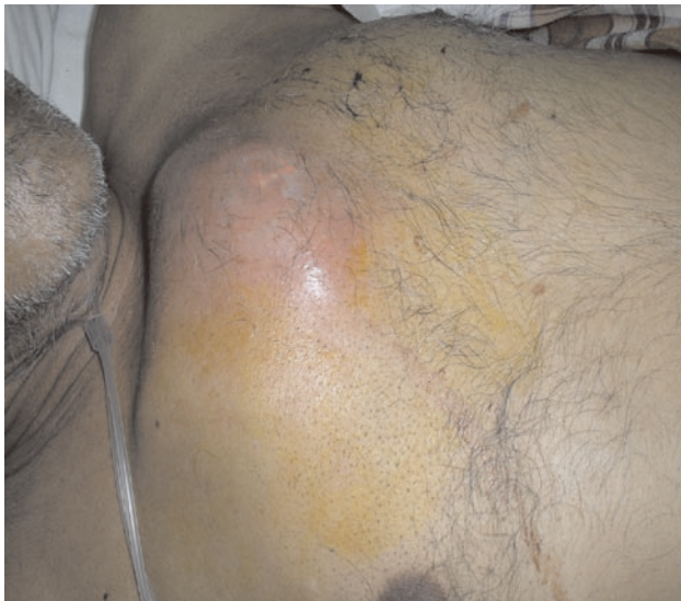
Figure 1. The above picture showing “hot abscess” over the right upper chest.

Two gram of intravenous ceftazidime was administered immediately and followed by 2 g every 8 hours. He was on intravenous ceftazidime and had daily wound dressing with normal saline for 6 weeks. He was then continued with 100 mg oral doxycycline every 12 hour and 480 mg oral co–trimoxazole every 12 hour for 20 weeks. His condition progressed very well and later secondary suturing was done. He was counselled regarding the risk of relapse and the eradication therapy, and the importance of the life long follow up. During his one year follow up recently, he was found to be well with no relapse.