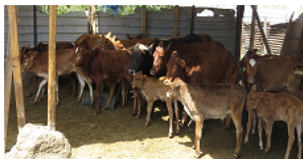
B. The second populations of the Qatif city