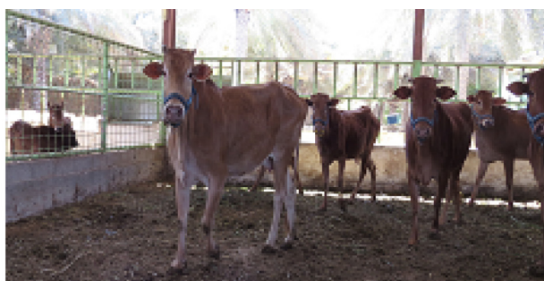
A. The first population of the Hofuf city