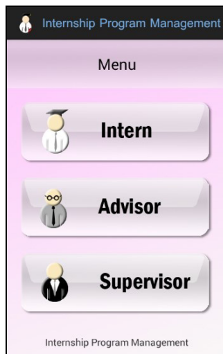
Fig. 7. Main menu of Internship Program Management