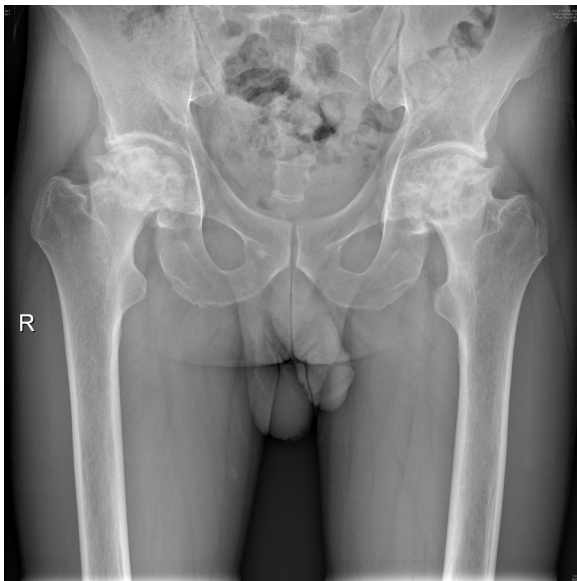
Fig. 1. Preoperative X-ray imaging.