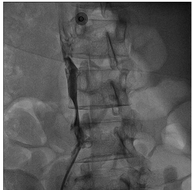
Fig. 1 – IVC venogram showing the proximal level of DVT with involvement of right common iliac vein and extending into IVC.

Peripheral venogram was done through PV sheath to assess the extent of thrombus. The thrombotic lesion was crossed with a 0.035' angled Terumo guide wire with 6F multipurpose (MP) guiding catheter (Cordis, Miami, Florida) and IVC venogram was performed to assess the proximal level of thrombus (Fig. 1). Multiple holes were made in the distal 5–10 cm of the MP catheter and it was placed in the proximal part of the DVT. Injection streptokinase 100,000 units/h infusion was given of which two-third dose (70,000 units/h) was through catheter and one-third dose (30000 units/h) through sheath. Injection of unfractionated heparin (UFH) 800–1000