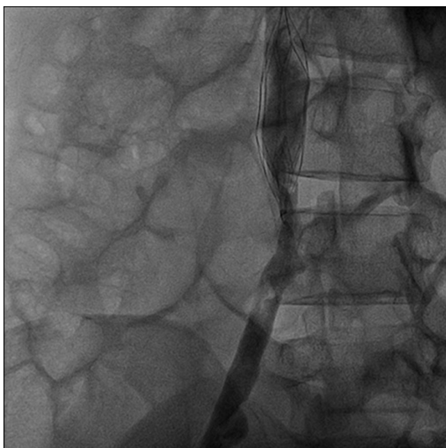
Fig. 3 – Venogram demonstrating >90% resolution of venous clot and IVC filter was also implanted in this patient.

units/h was given through the sheath and activated plasma thromboplastin time (APTT) was monitored to maintain APTT between 60 and 90 s. Mechanical thromboaspiration was done using 8F MP catheter attached with a 50 ml syringe in those patients who did not show response to thrombolysis. Venogram was repeated after 24 h and infusion was continued till there was a satisfactory result or any sign of adverse events present. Percutaneous transluminal angioplasty (PTA) was