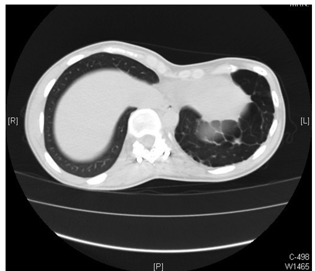
Fig. 2. Non-contrast computerized tomography showing multiple left basilar bullae.