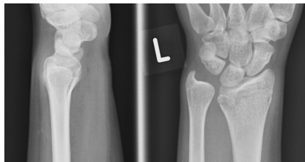
Figure 1 Postero-anterior radiograph of the wrist revealing subtle Madelung's deformity discovered incidentally following injury to the wrist: the V-carpus and prominent ulnar can be seen.

was admitted for computerised tomographic imaging and planned open reduction and internal fixation of the fracture. Opinion was divided at our morning trauma meeting, regarding appropriate non-operative or operative management of this patient. Close inspection of the CT images raised the