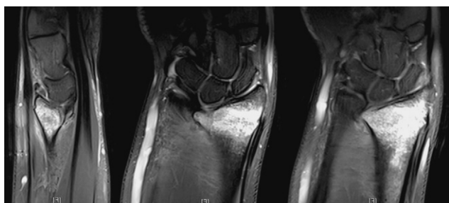
Figure 3 T2 weighted magnetic resonance imaging of the wrist demonstrating old changes at the ulnar-volar aspect of the distal radius (without associated high signal) and a cortical breach of radial styloid with an associated focus of high signal consistent with a new fracture.

possibility that the abnormality seen could represent an old condition (Fig. 2). T2 weighted magnetic resonance imaging of the wrist (Fig. 3) confirmed an old Madelung's deformity (without associated high signal) and a cortical breach of the radial styloid with an associated focus of high signal consistent with an undisplaced fracture. The patient was managed non-operatively resulting in a pain free wrist when reviewed at the 3-month clinic follow-up appointment.