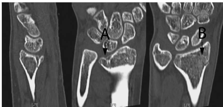
Figure 2 Computerised tomographic imaging of the wrist showing the two abnormalities. A. Madelung's deformity. B. Radial styloid fracture.