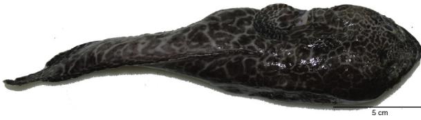
Figure 1. Collected specimen of Sanopus reticulatus , dorsal view (Yuc-pec-356).

were collected because of the advanced state of decomposition. Additionally, we collected 2 adult S. reticulatus in Celestún while scuba diving on September 26, 2015. The specimens were deposited in the Colección ictiológica regional de referencia UMDI Sisal (Semarnat Yuc-Pec 239-01-11) of the Unidad Académica Yucatán, Universidad Nacional Autónoma de México, under collection numbers Yuc-pec-356 and 357.