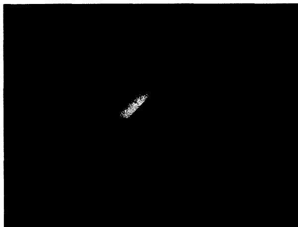
Fig. 2. Typical wedge-shaped ttTRS crystal suitable for X-ray analysis. The dimensions are 0.45 mm \times 0.35 mm \times 0.20 mm.

obtained by transformation of the strain BL21(DE3)pLysE [20] were grown in Terrific Broth [21] at 37°C. The specific threonylation activity of unfractionated tRNA of the crude extract that has been heat treated for 10 min at 70°C in order to inactivate E. coli TRS was \sim 80 \times higher than that of a crude extract from T. thermophilus . Overexpression of ttTRS was confirmed by analysis of the extract by SDS/PAGE which showed an accumulation of the protein.