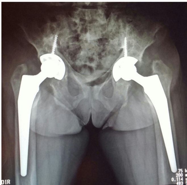
Fig. 5. X-ray image showing the absence of osteolysis, good osseointegration of prosthetic components to the right and acetabular components to the left, with migration of the femoral component and increased left femoral varus.

After a 4 year follow-up, the Harris hip score was 86 (good) on the right hip and 81 (good) on the left hip, with bilateral Trendelenburg gait, more pronounced to the right. The patient complained of pain on the middle third of the left thigh, without functional loss. The X-ray showed 0.9 cm distal migration of the left femoral component and increased varus when compared to previous exams. Besides that, there was good osseointegration of the acetabular components with no signs of osteolysis and no change of the right femoral component (Fig. 5).