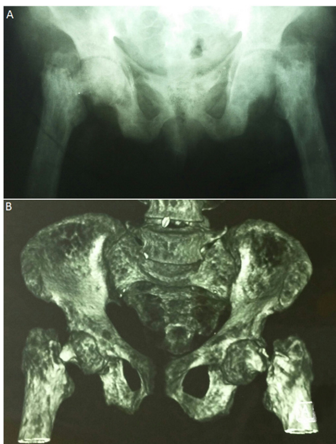
Fig. 1. (A) X-ray images showing poor bone quality and deformity on both hips; (B) computed tomography image of the pelvis clearly demonstrating displaced fractures of both femoral necks.

A 49 year old, chronic renal diseased female patient, on regular dialysis for 15 years, with major complaints of pain in both hips, reported sudden pain in the hip when trying to wear her pants by standing on her right single leg. It came to a fall on the ground and the impossibility of moving both hips. She was brought to the emergency room complaining of severe pain and immobility of both hips. We performed the scrolling test of the lower limbs that denoted an important aggravation of the pain. The X-ray revealed a fracture on both femoral necks and very poor bone quality, which prevented a proper assessment of the fracture. The CT scan of the pelvis clearly showed the presence of displaced fracture (Garden 3) on both femoral necks (Fig. 1A, B). In her preoperative preparation, we noticed significant changes in leukocyte levels and red series, besides clinical repercussions of heart failure, a fact that delayed her release to surgery. Hypocalcemia (6.8 mg/dL; normal level, 8.4–10.5 mg/dL) was also noticed, as well as elevated levels of parathyroid