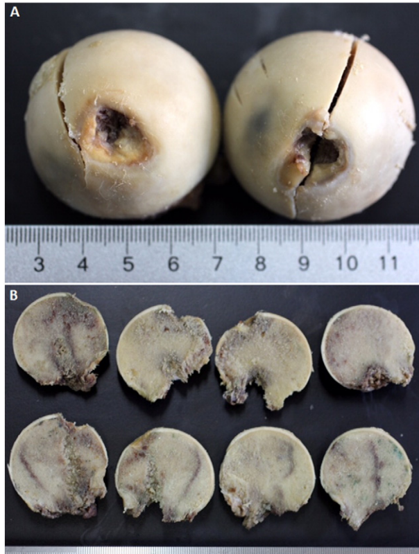
Fig. 3. (A) Picture of the femoral heads in position, according to each side. (B) (Upper) Slices of the femoral head to the left; (lower) slices of the femoral head to the right, both featuring extensive areas of necrosis.