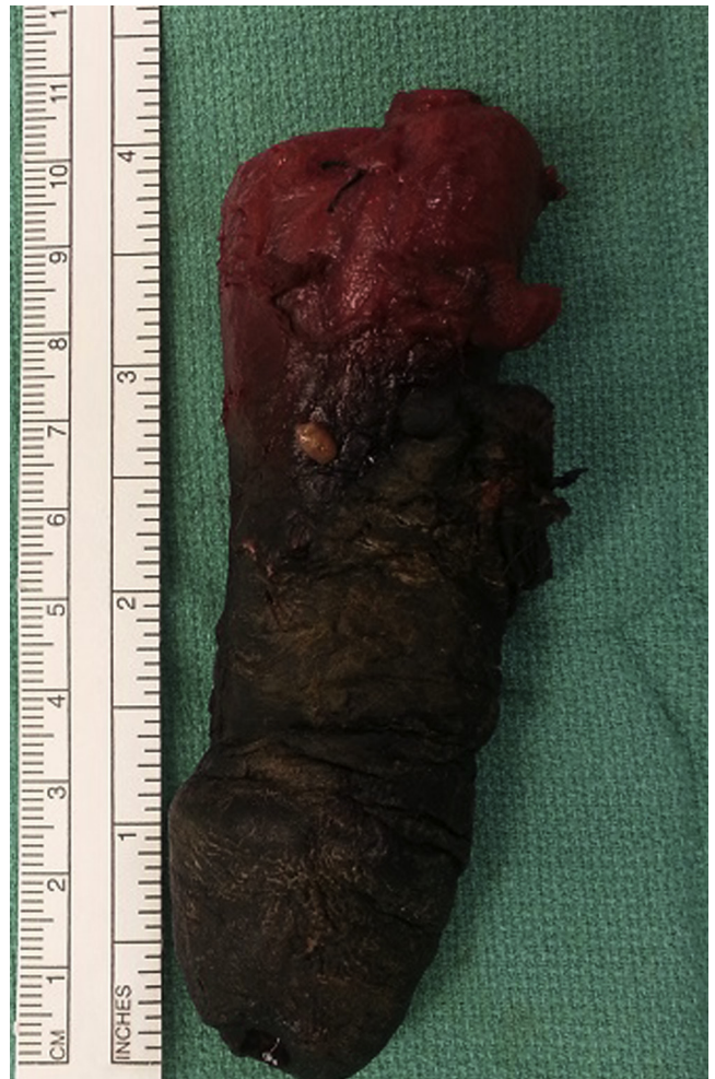
Figure 3. After second debridement – penectomy specimen.

Once cultures returned positive for Rhizopus amphotericin B was administered, but 4 days had already passed since the initial