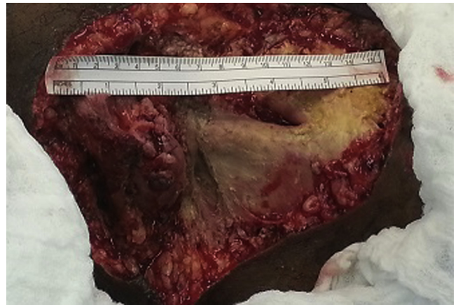
Figure 2. After second debridement.

Firstly, the patient did not possess the fetid odor that usually occurs as part of bacterial Fournier's gangrene. Secondly, the patient had what appeared to be an infarcted testicle intra-operatively,