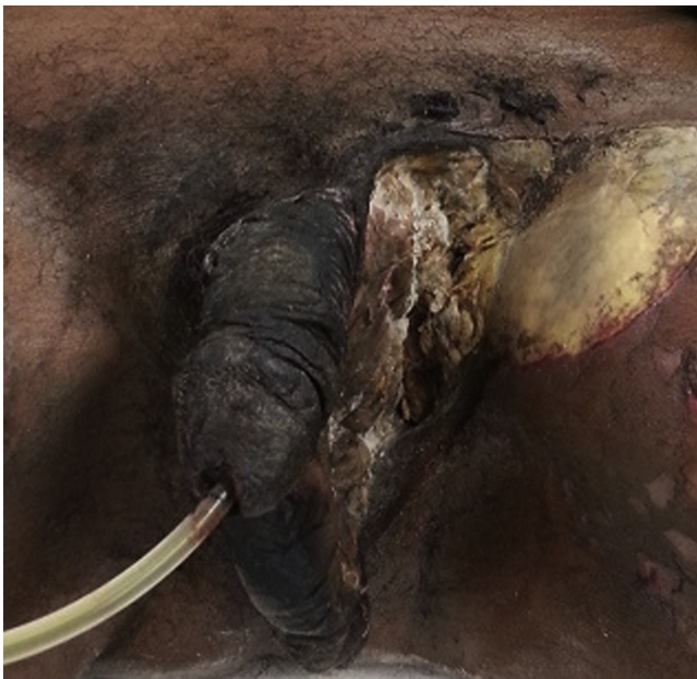
Figure 1. After first debridement.