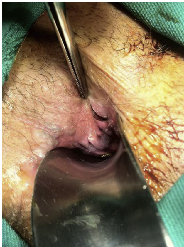
Fig. 2 – Transoperatory demonstrating posterolateral sinus containing hair in its interior.