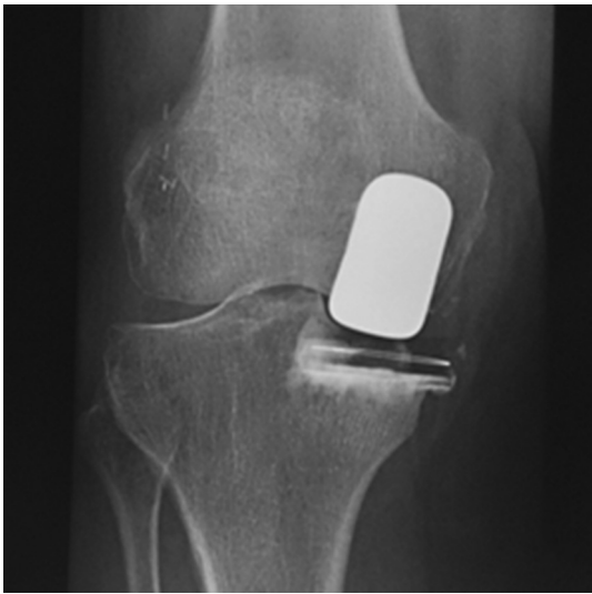
Fig. 1. Knee pain after unicompartmental arthroplasty (malposition): the femoral implant impinges on the spines and the tibial plateau is too wide.

in 29 (80.6%) patients, avascular necrosis in 6 (16.7%), and inflammatory joint disease in 1 (2.8%). At revision, both components were replaced in 8 (22.2%) knees, the femoral component only in 7 (19.4%) knees, the tibial component only in 19 (52.8%) knees, and the insert only in 2 (5.6%) knees.